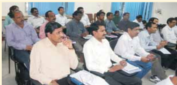
Trainees attending the lecture