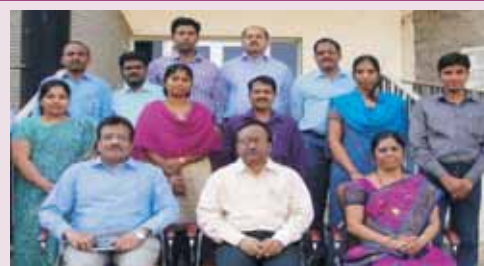
Director General NIPHM with faculty and trainees

The recent national standards on Phosphine fumigation generated a need to have Refresher Programmes on Phosphine fumigation. This 3 days course programme was developed to provide stakeholders an opportunity to update with recent developments. One programme was organized from 6 th to 8 th March 2012 Seven participants from different industries were participants in this training.