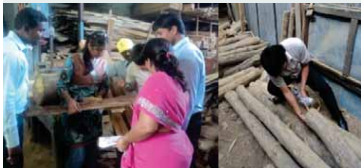
Survey for timber-log pests by the Trainees

This programme deals with the pests of timber logs and solid wood packaging material. It aims to develop the thorough understanding of the issues involved in the usage of solid wood packing material in international trade and the potential threat of pests accompanying various types of logs / sawn timber. Timber trade and relevant phytosanitary issues involved are covered additionally. This programme is offered as a subset of "Phytosanitary Treatments" Programme and was organized from 6 th to 24 th March 2012. Six participants underwent this training.