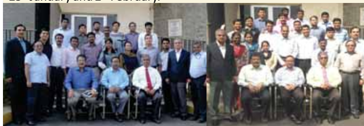
Director General with IAS Officer Trainees & faculty

The National Institute of Plant Health Management (NIPHM) has been identified as one of the Centre for Attachment of I.A.S. Officer Trainees by the Lal Bahadur Sastry National Academy of Administration. During the year 2012, 32 I.A.S. Officer Trainees in two batches attended the Attachment Programme at NIPHM on 25 th January and 2 nd February.