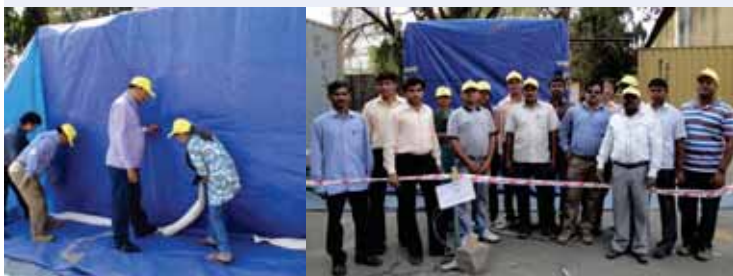
Trainees laying sand snakes in fumigation process

NIPHM is one of the notified Institutes to impart training on Methyl Bromide and Phosphine Fumigation. The dire need of quality training and hands-on exposure in practical aspects of the fumigation industry was addressed by this programme. Two batches were trained in this Training on Fumigation from 23 rd January to 6 th February and from 12 th to 26 th March 2012. 21 participants from private industry and five PGDPHM students attended.