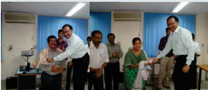
1 st and 2 nd rank holder participants being felicitated by the DG NIPHM

A 84 days Pesticide Formulation Analysis Course was organized from 31 st January 2012. A total of 18 Officers from State Agriculture Departments and Private Companies of Andhra Pradesh, Tamil Nadu, Madhya Pradesh, Rajasthan and the students of PGDPHM actively participated in this programme. The first and second rank holder participants in the training programme were also felicitated by the Director General NIPHM.