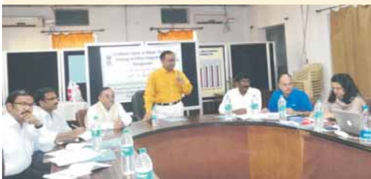
Trainees attending the lecture delivered by Director General NIPHM

Two 15-days Certificate course on Master trainers' training on Urban Integrated Pest Management for Professionals of Structural Pest Management Industry were organized from 19 th to 24 th December 2011 and 2 nd to 10 th January, 2012. Ten participants were trained on biology and management of structural/ industrial pests including rodent pest management.