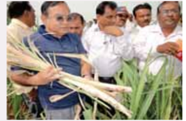
Rodent damage being recorded in sugarcane crop in Bardoli, Gujarat

NIPHM extended expert consultancy services to Government of Andhra Pradesh, Gujarat and Sikkim as per the request of respective State Commissioner of Agriculture. Management options for different cropping patterns & agroclimatic situations were provided to minimize the rodent pest problems.