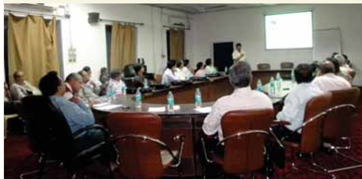
Senior Officers of DAC attending the orientation programme

One batch of senior officers of the level of Under Secretaries & above from Department of Agriculture and Co-operation attended Orientation Programme on Plant Health Management, Biosecurity, Pesticide Management and various activities initiated by the NIPHM along with the future thrust areas for plant health management.