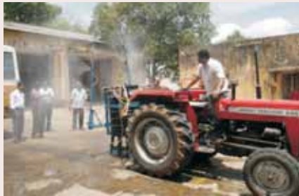
Demo of tractor mounted sprayer

A training on "Pesticides Application Technology" was conducted from 1 st to 8 th February. Officers from Andhra Pradesh, Tamil Nadu were trained in principles of pesticide application techniques,