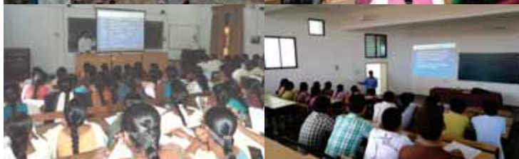
Students attending theory and practical classes