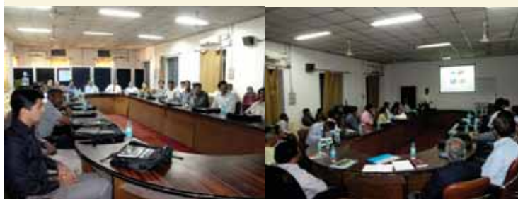
IAS Officer trainees attending lecture sessions

The Trainees were taken around the various Laboratory facilities at the Institute.