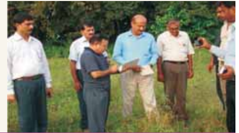
Rodent damage being recorded in rice crop in Madhepura, Bihar

NIPHM Hyderabad has organized fourth Refresher Training on Rodent Pest Management to the officers of Department of Agriculture, Bihar from 7 th to 13 th January, 2012 with venue at ICAR complex for North East States, Patna. Thirty six (36) officers from different districts of the State were imparted the training. Exposures were given on general morphology and basic aspects of rodent pests and their management. The participants worked out Action Plan for organizing community based rodent control campaigns in their respective jurisdictions.