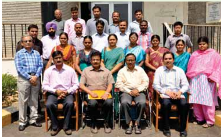
Director General NIPHM with faculty and trainees

A training programme on production protocols of bioagents and biopesticides was organized from March 19 th to 29 th , 2012. A total number of 17 participants from Andhra Pradesh, Jammu, Punjab, Chattishghad, Orissa and Nagaland attended the training programme. The protocols for mass multiplication of fungal, bacterial, viaral bioagents and rearing host cultures was the key component of both theory and practical classes.