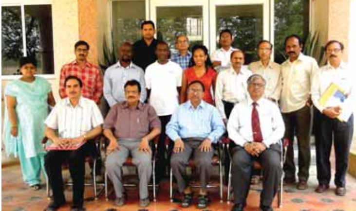
Director General NIPHM with faculty and trainees

A training programme was organized on Integrated Pest Management for participants from India and South Africa under IBSA trilateral cooperation from March 12 th to 30 th March 2012. Participants from Ministry of Agriculture, Forestry & Fisheries South Africa and Directorate of Plant Protection, Quarantine and Storage India participated in the programme. The principles, concepts and technologies of IPM, Ecological Engineering and AESA for different crops were taught through lectures and field visits. Lectures on Pest Surveillance, Plant Quarantine, Pest Risk Analysis, Plant Biosecurity and Incursion Management were also delivered on spacial request of South African participants..