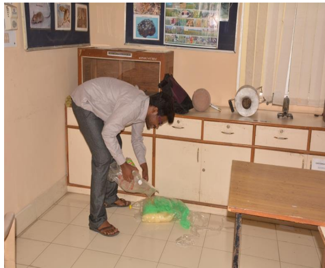
Plastic waste collection in laboratories