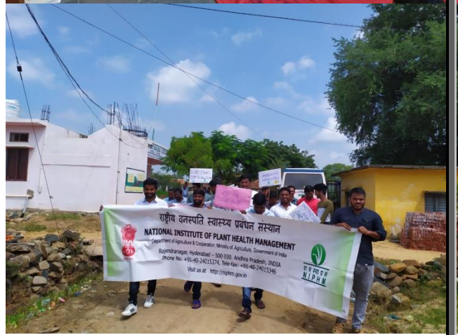
Awareness programme and rally on plastic waste collection at Mohammadnagar, Hyderabad