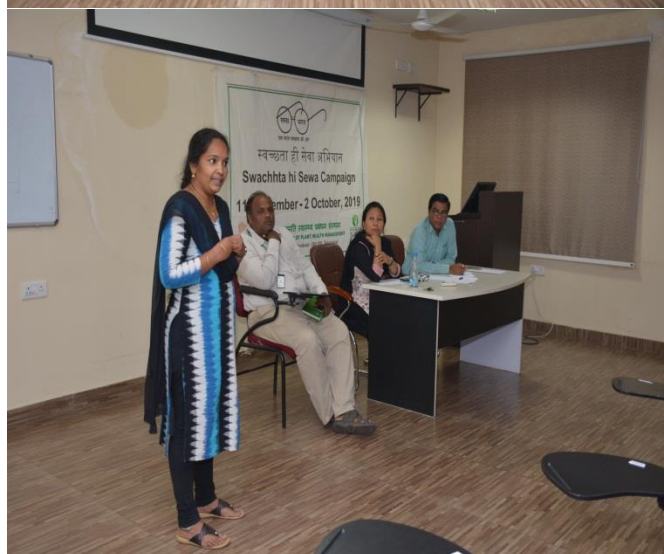
Essay writing and elocution competition organized for officers, staff & students at NIPHM