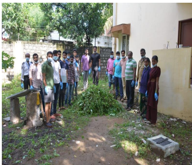
Removal of Weed and cleaning activity at NIPHM Residential area