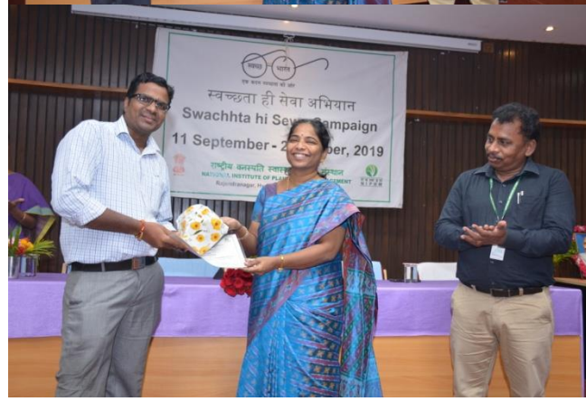
Prize distribution to the winners of essay writing and elocution competitions