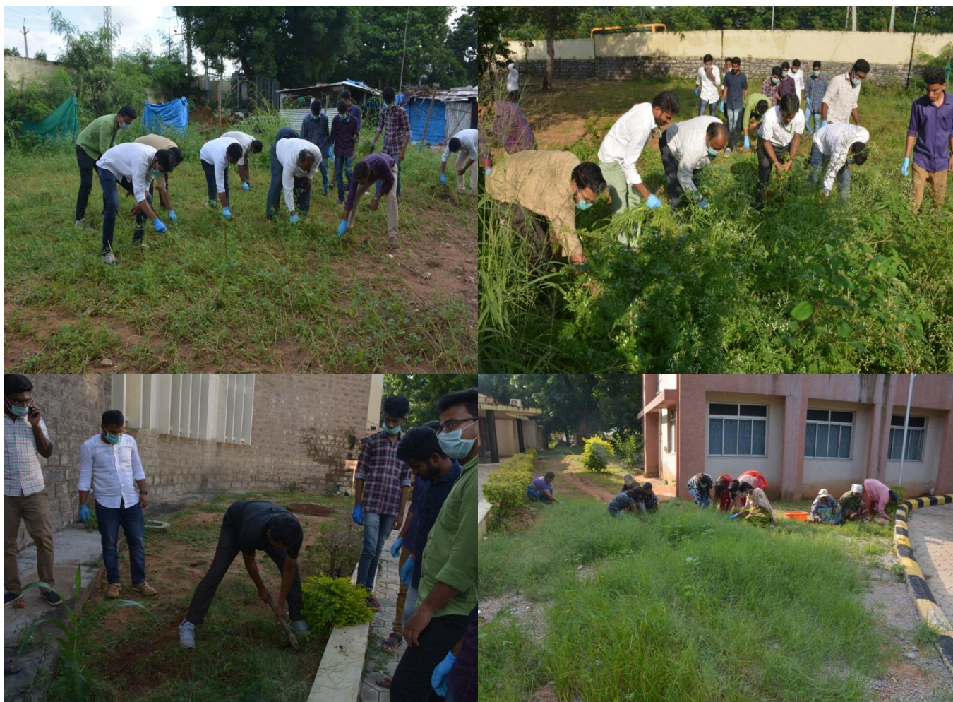
Shramdaan/weeding & cleaning activity at NIPHM campus