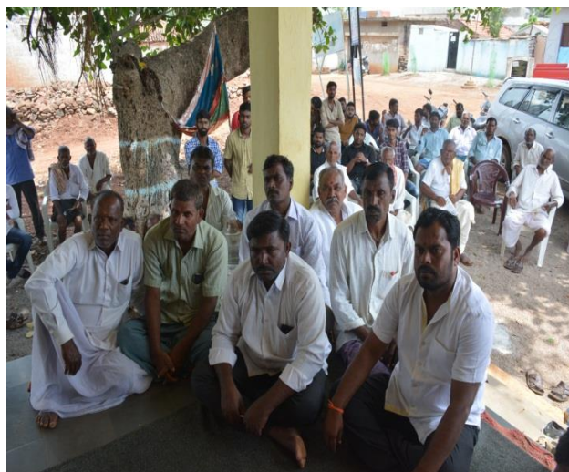
Awareness programme organized for farmers on recycling and effective disposal of the plastic waste at Gajulaguda Village