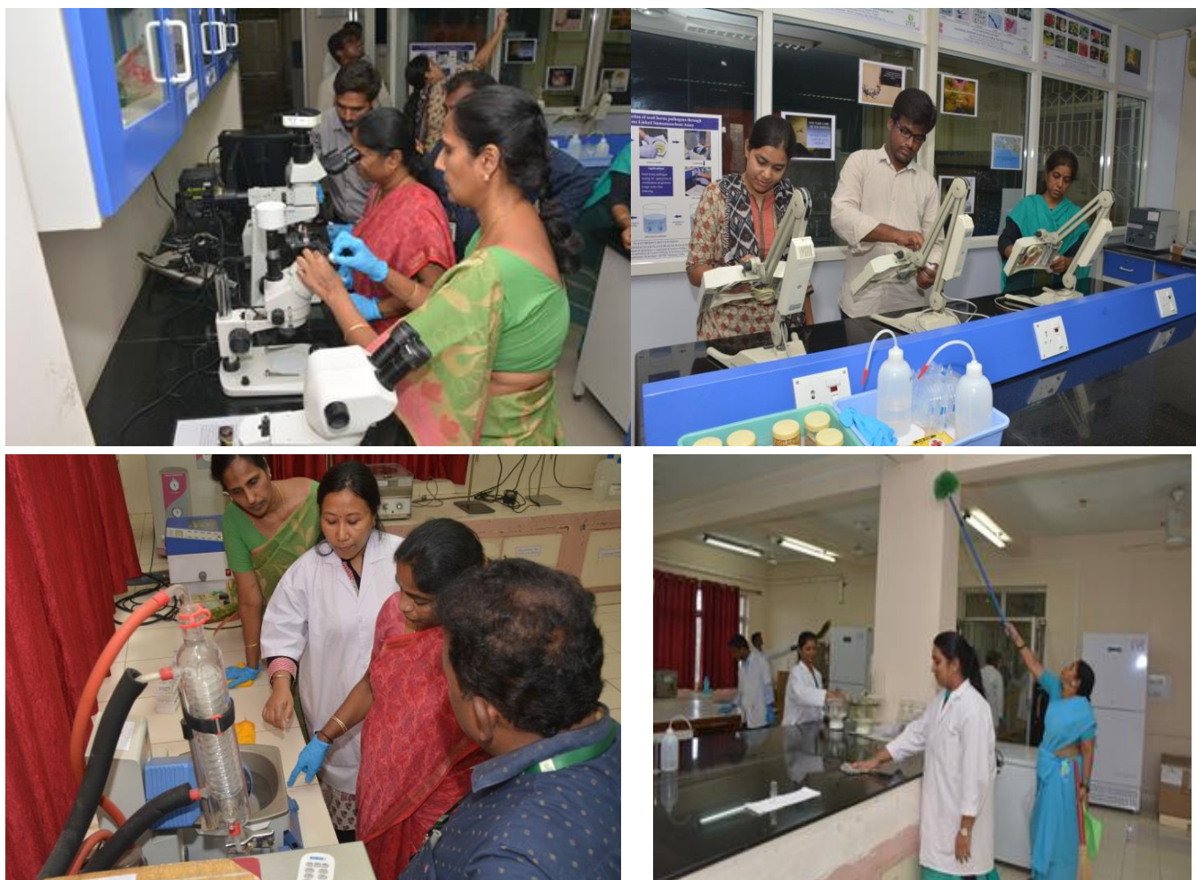
Cleaning of NIPHM laboratories/Workshops and segregation & disposal of single use plastic material