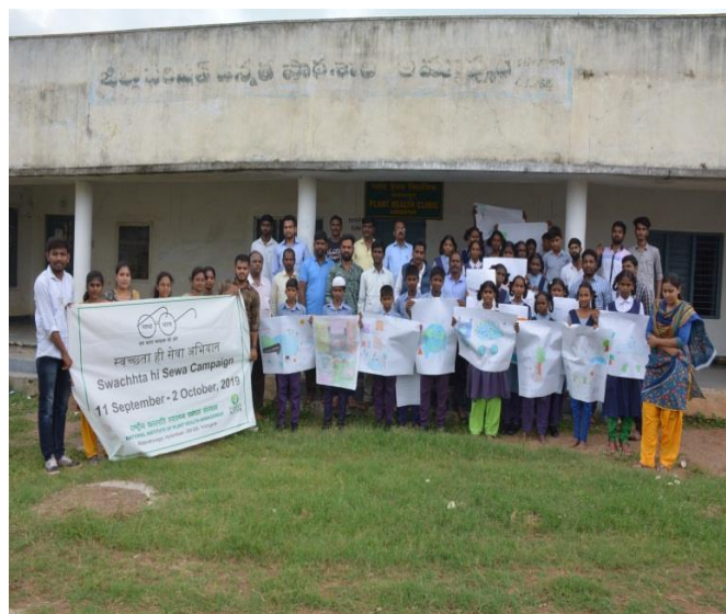
Competitions organized at Zilla Parishad High School, Amdapur