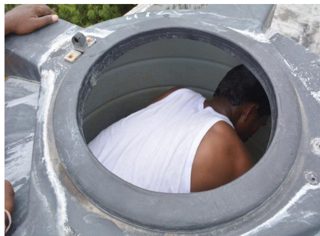
Water tank cleaning at NIPHM Old Hostel