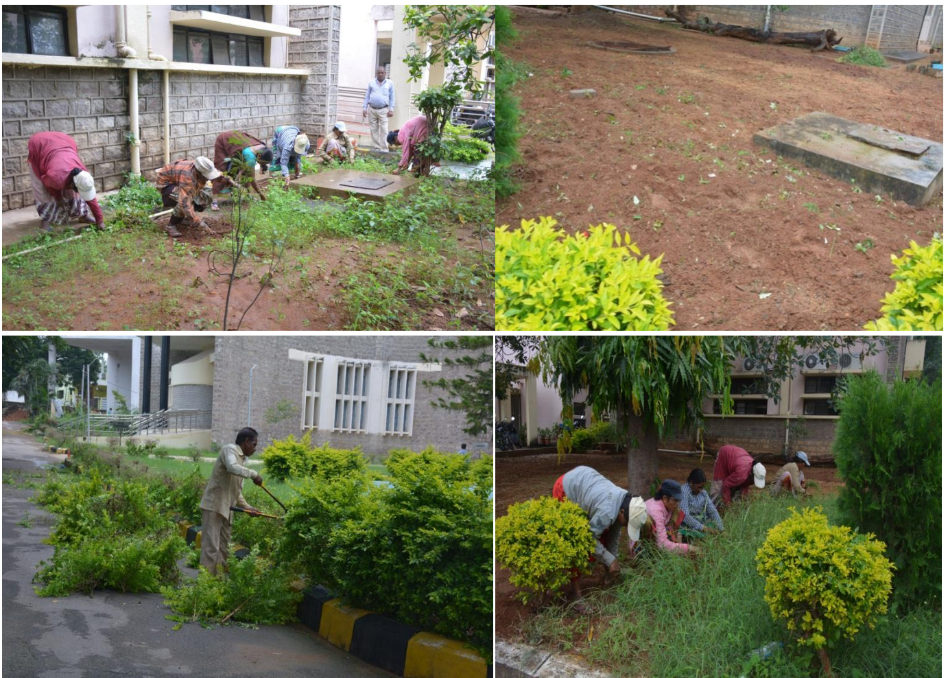
Weeds removal at Institute premises

The need for maintaining the right cleanliness sanitation and hygiene in any country/community is very essential. While talking on cleanliness, Mahatma Gandhi stressed that cleanliness is next to godliness and said that a clean body cannot reside in an unclean city.