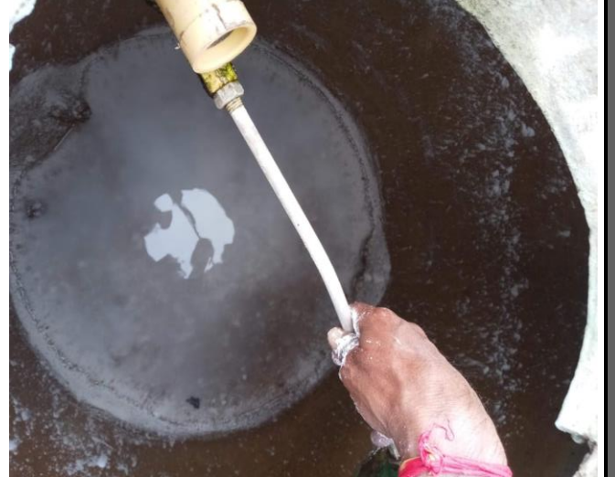
Water tank cleaning activity at NIPHM Residential campus on Hostel on 28.09.2019