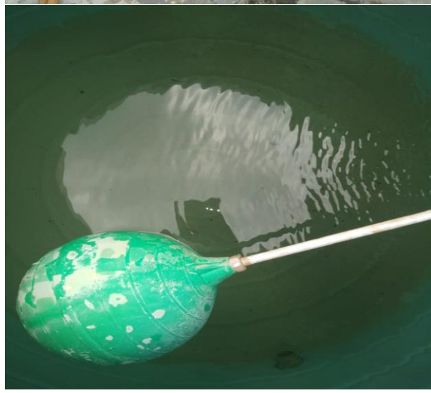
After and before photographs of Water tank cleaning activity in New Hostel