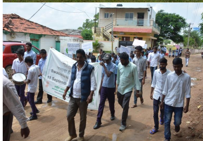
Awareness rally for plastic waste collection and segregation at Amdapur, RR District