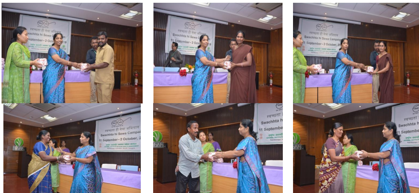
Felicitation of housekeeping staff by Director General, NIPHM

Housekeeping staff of NIPHM always ensures the regular cleaning and hygiene in NIPHM premises including all the laboratories, lawns, hostels and canteen etc. On the occasion of Swachhata Hi Seva campaign; DG, NIPHM honored the housekeeping and gardening staff and appreciated their contribution to make the NIPHM campus clean and green.