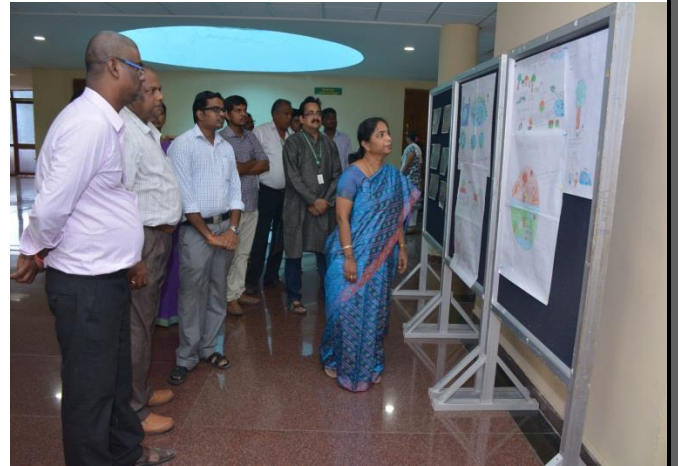
Exhibition of paintings and slogan at NIPHM on closing day of Swachhta Hi Seva campaign on 02.10.2019